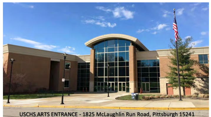
USCHS ARTS ENTRANCE - 1825 McLaughlin Run Road, Pittsburgh 15241